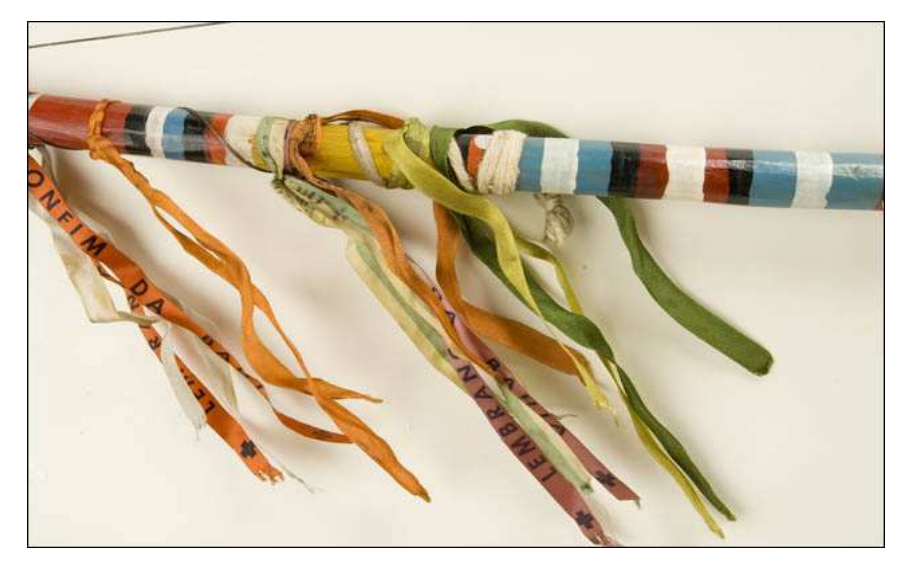
Image 1: Detail of the HRE436 Berimbau at the Helinä Rautavaara Museum

Helinä Rautavaara museum has been visited by old masters of capoeira, together with their followers. They have seen archival photos of capoeira players, listened to recorded tapes of radio programs that Rautavaara had made, and read Rautavaara's transcriptions of her interviews with Brazilian capoeiristas and even seen sequences of documentary film. Today part of all types of material is digitized, and the material is easier to present to visitors. Devoted capoeiristas are still visiting the museum, giving their explanations, corrections, interpretations and opinions about the material. But in the future, most of them will probably visit our material by the WWW.