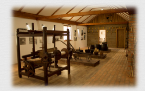
Vukomeričke gorice homeland collection