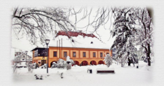
Museum of Turopolje