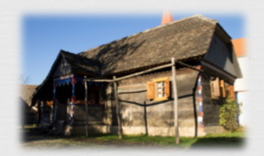
Ethno -house Ščitarjevo