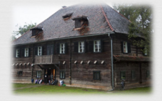
Modić Bedeković manor