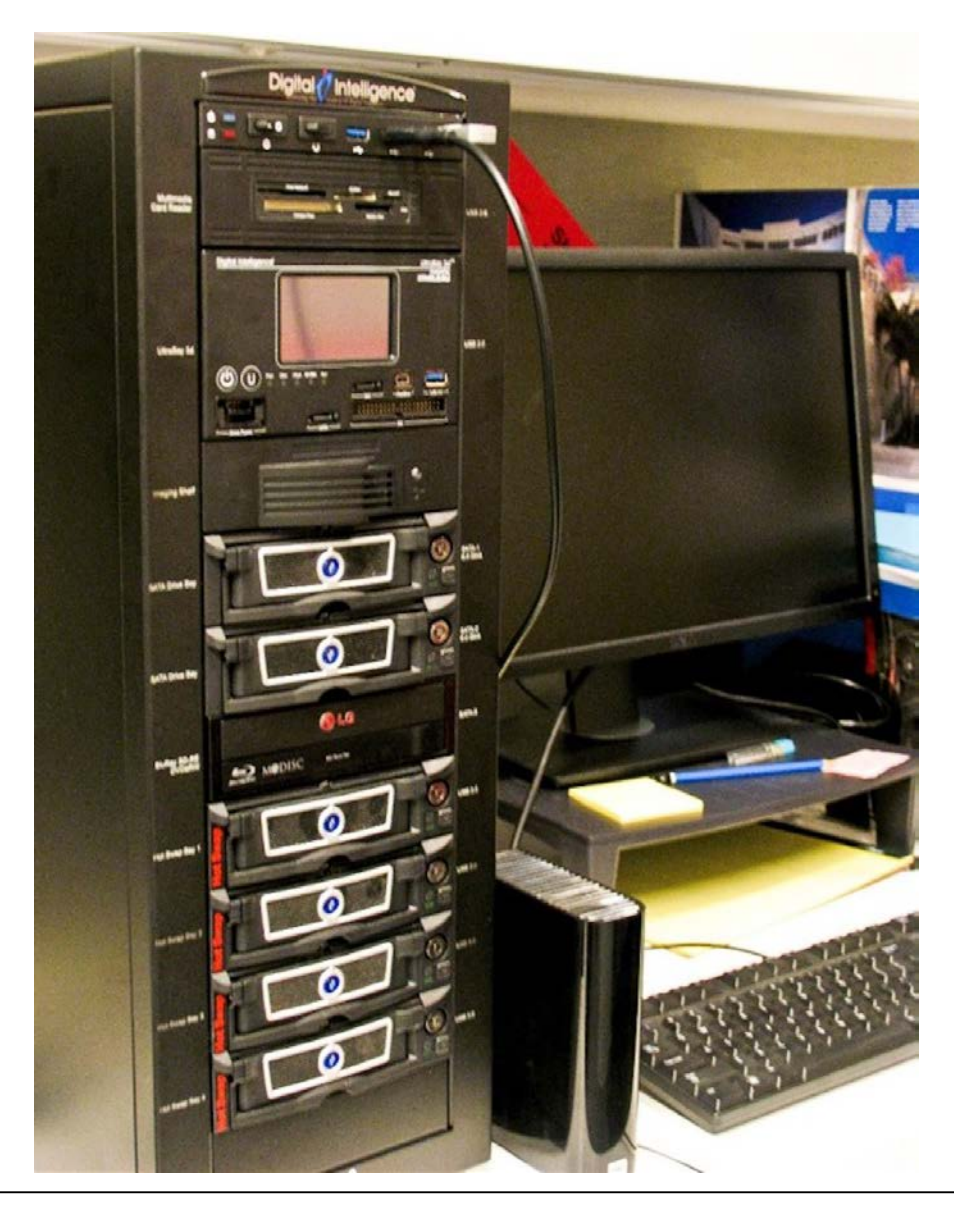
Figure 5. Digital forensic equipment used to analyze the content of electronic records at the Getty Research Institute.

In a very different project, Nancy Enneking and her staff at the J. Paul Getty Trust Institutional Archives is making strides to safely capture electronic records from a wide range of legacy storage media, portable hard drives, networked servers, and the internet, and then transfer the data safely to servers. The process involves creating a disk image and capturing metadata needed to support longterm preservation. The team is also using digital forensic software analyze the content of these records [Figure 5]. The project includes developing guidelines for curators as they are acquiring collections that have born digital content. Other museum archives have similar projects to preserve electronic records, including the Cleveland Museum of Art and the Museum of Fine Art, Houston.