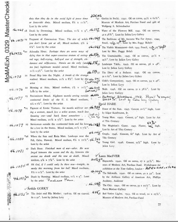
Figure 1. Museum of Modern Art master exhibition checklist from Fourteen Americans [MoMA Exh. #329, September 10-December 8, 1946]. <a href="http://www.moma.org/momaorg/shared/pdfs/docs/archives/ExhMasterChecklists/MoMAExh_0">http://www.moma.org/momaorg/shared/pdfs/docs/archives/ExhMasterChecklists/MoMAExh_0</a> 329 MasterChecklist.pdf

Under the direction of Michelle Elligott, the Museum of Modern Art Archives is in the midst of a thirty-month project to fully process and open to the public MoMA's exhibition files from 1929 through 1989. The results of the first phase of the project, from 1929 through 1963, can be seen in the online finding aid. This project for the first time unites registrar records with those from curatorial departments while presenting a detailed folder-level description of the collection. Additionally, the project has allowed for the scanning and online presentation of exhibition "master checklists" [Figure 1] and the indexing of exhibition-related press releases, all of which are now linked to the finding aid. At the same time, project staff have been indexing participating artists and curators for the 2000-plus exhibitions in MoMA's history, work that has grown to include more than 17,000 unique names. This fall, as part of a multi-year redesign of the MoMA website, the Archive's artist index data, checklist scans, press releases, and installation images will be connected to exhibition data in the Museum's collection management system and deployed online as the Museum for the first time publishes its full exhibition history on its website, moma.org. By next year, content from the Archives will be fueling the Museum's web site as never before.