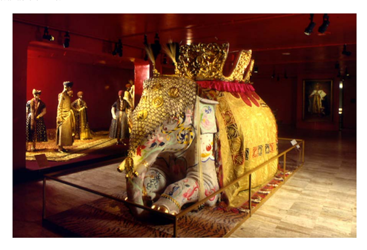
Figure 2. Gallery 46 from the Costumes of Royal India exhibition at the Metropolitan Museum of Art, New York, on view December 20, 1985–August 31, 1986.

The Metropolitan Museum of Art Archives, under the direction of Jim Moske, has just processed 136 linear feet of historical records and administrative files of the museum's Costume Institute, one of the world's leading costume collections. Included are curatorial records, scrapbooks, and publicity materials on more than 100 special exhibitions staged between 1937 and 2008, such as "The World of Balenciaga" (1973), "Romantic and Glamorous Hollywood Design" (1974), "The Glory of Russian Costume" (1976), "Vanity Fair" (1977), and "Costumes of Royal India" (1985-86), which even included a costume for an elephant [Figure 2]. This material provides an incomparable trove of information about the department to engage scholars in new dialogues and studies on costume history, fashion design, and associated fields. A complete inventory is available online.