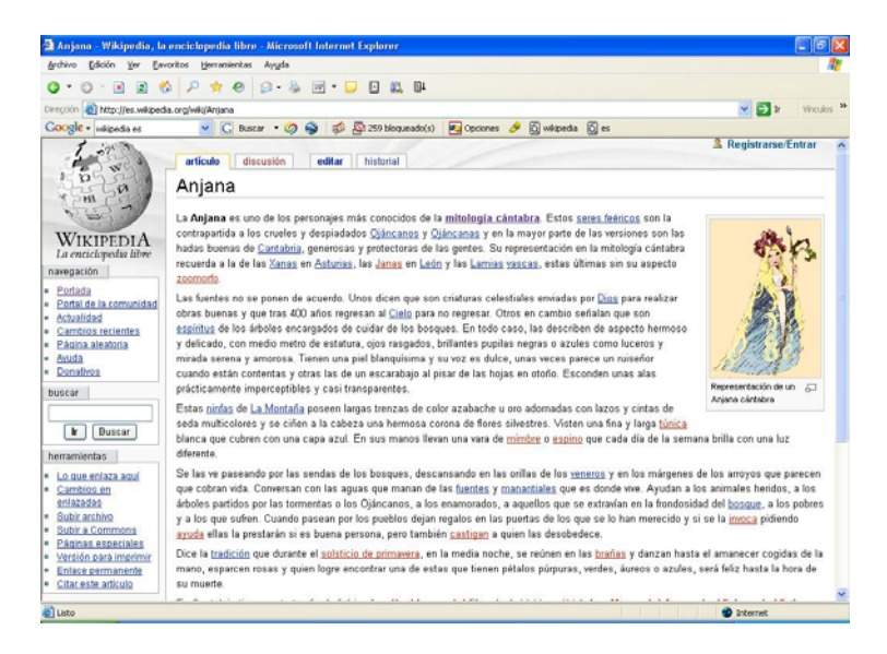
Figure 4: Wikipedia front page

One of the most important issues when using ontology in large industrial applications in the ontology maintenance and evolution. Wikipedia software has proven to be an efficient and usable method for collaborative knowledge management. We have included a semantic extension to the traditional software. The semantic Wikipedia allows for new semantic data acquisition and modification by expert users, not necessarily with semantic web technology background. With an user management extension, authorized users can modify ontology content, suggesting modifications on specific data. These modification are then included into the ontology by a supervised workflow process.