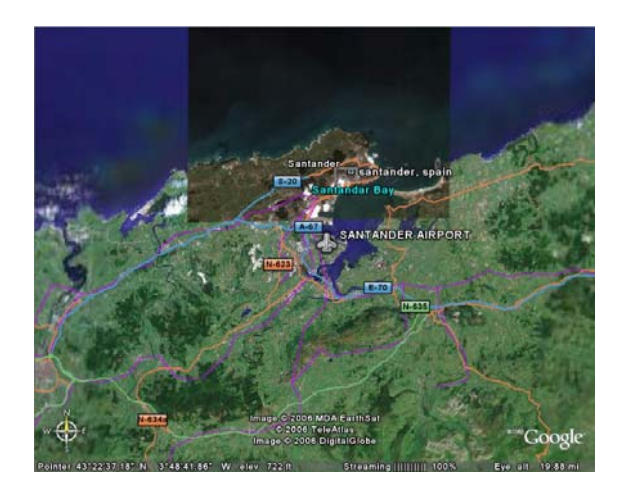
Figure 2: Satellite map for Cantabria region

Since the ontology contains geo-positions for resources like Site or Place , and most of the instances have some relation to those concepts, they can be represented over a map picture. The Interactive Map application allows for placing different domain layers, such as singular buildings, churches, caves, etc. on the map in an interactive way and connected to the ontology.