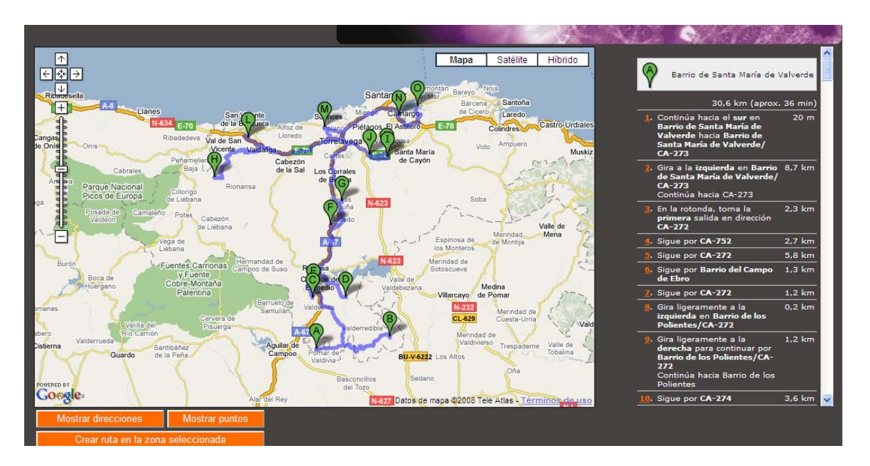
Figure 3: Routing Application showing "Romanic Route"