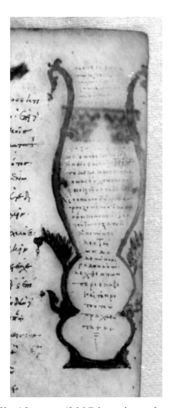
Detail of folio 12 recto (2007 imaging, ultraviolet light)

This comment happens to survive in three other manuscripts as well, but it is certain that other valuable material to be found only the Venetus A is fading from view just as