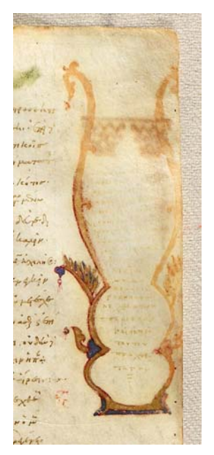
Detail of folio 12 recto (2007 imaging, natural light)