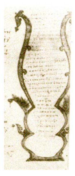
Detail of folio 12 recto in Comparetti's 1901 facsimile

For example, on the first page of the text of the Iliad , folio 12r (featured on the first page of this article), there is a beautiful lyre adorning the top right corner, and inside that lyre is writing that is completely illegible in both Comparetti's facsimile of 1901 and in the 2007 natural light image. (See figures 2 and 3). Ultraviolet light revealed the bulk of the text, and we were able to determine that it consists of a previously known comment from the D scholia about the way that the action of the poem begins in the tenth year of the war.