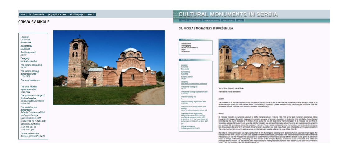
Picture 01: The old and the new description of the St. Nicolas Monastery in Kuršumlija in the Digital catalogue of cultural monuments

There is an extensive body of papers about these monuments, and some of them have already been described in a Digital catalogue of cultural monuments. Now, however, they have been approached in a slightly different manner in accordance with the contemporary trends. The best way to demonstrate this is to compare the old and the new description in the Catalogue. The old description contains only a processed photograph of the monastery on the front page, a modest text taken from another publication, sometimes an English translation of the text, and no documentation. On the other hand, the new description contains more processed photographs, an extensive text divided into sections, a professional English translation and the documentation with additional remarks (Picture 01).