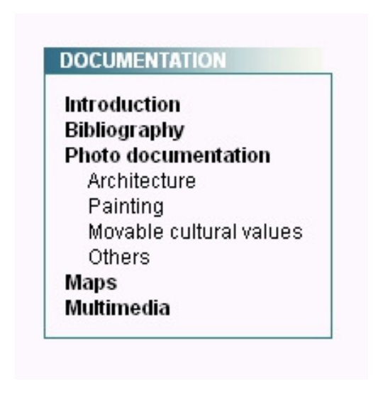
Picture 02: The supporting documentation to the description of the Monuments and Sites in the Digital catalogue of cultural monuments

organized so that, in addition to the home page (which contains the description and basic data of the monument), also contains the so-called supporting "documentation". This documentation is divided into five sections: introduction, bibliography, photo documentation, maps and multimedia, and each section into four categories: architecture, painting, movable cultural values and other. Each category can also contain one or more digital documents referring to the monument (Picture 02).