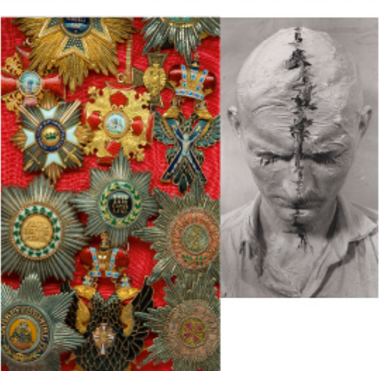
First Public Museum of Austria