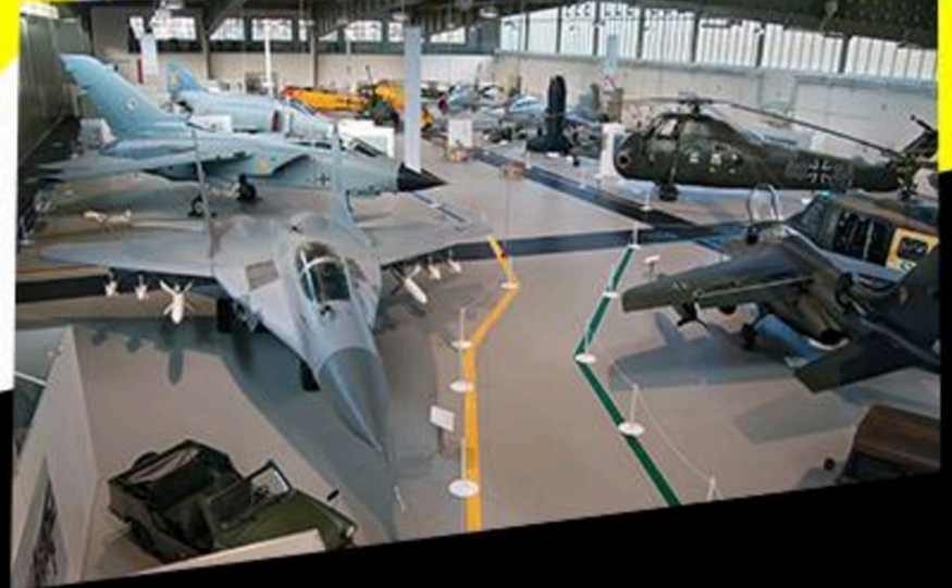
Hangar 7 geöffnet