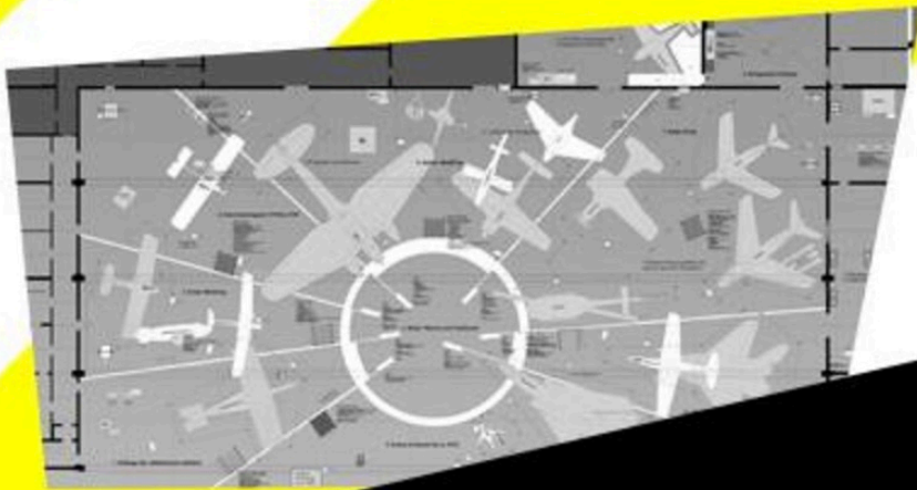
Hangar 3 im Umbau