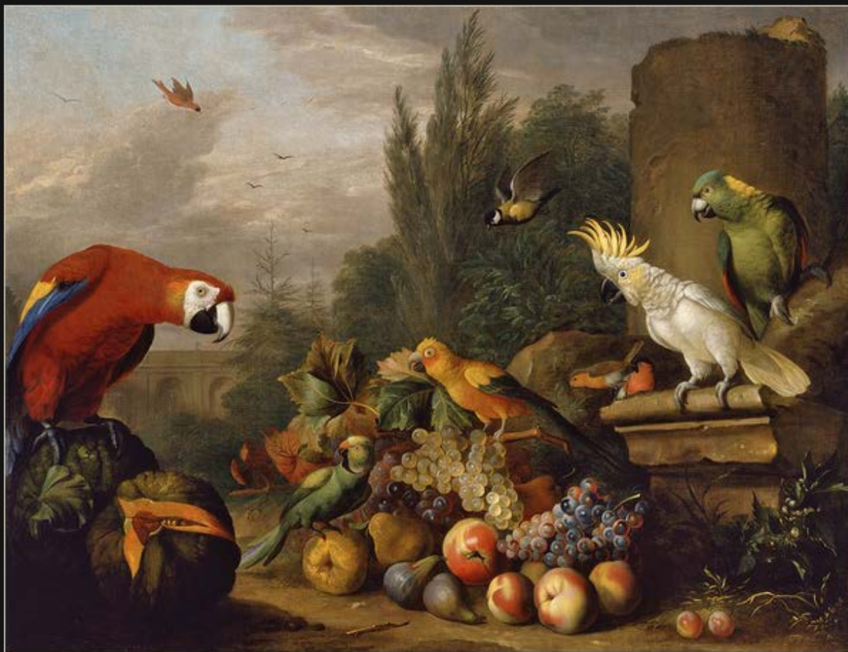
Gyümölcscsendélet papagájokkal és fehér kakaduvál