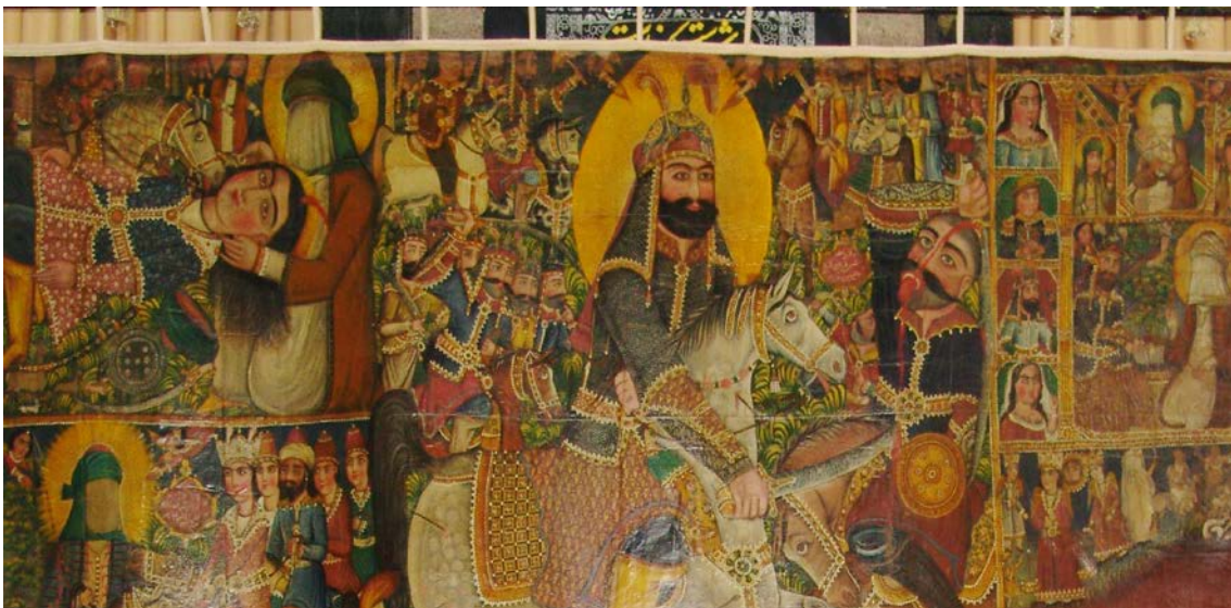
Painting collection of CIBM: After conservation: Battle of Neynava and related stories (Qajar period- 1814 A.C)

Completing the objects profile; adding researches and studies about storytelling illustrations.