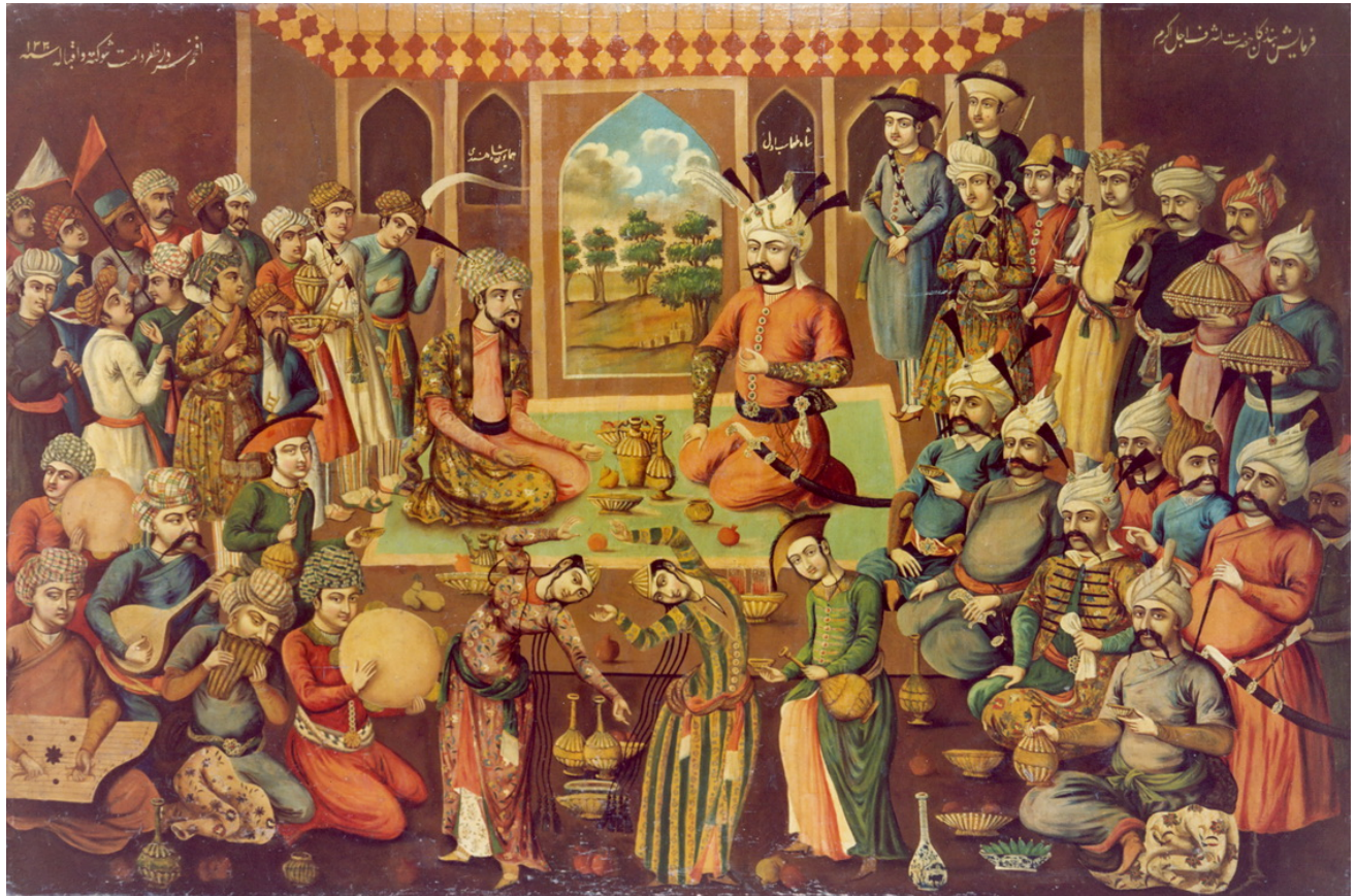
Painting collection of CIBM: King Tahmasb meets king Homayoun from India in a banquet. (Qajar period)

and had a real facts and references? Or it was just the story which again became a part of anecdotes.