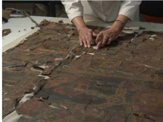
Before conservation: Battle of Neynava and related stories (Qajar period- 1814 A.C)