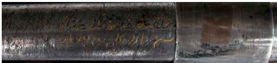
Arms and Armors collection of CIBM: Noh Dal rifle- Inscriptions on object

After his cooperation with CIBM, and during many sessions, this object, its inscribed poems and concepts were identified and examined. Thus it was cleared and confirmed that to whom has belonged this rifle originally, which had been mentioned before in lullabies, tales and native songs.